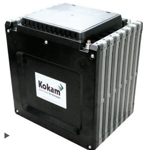
KBM 255 14S - 3.8kWh ▶

Cells within the modules are maintained at optimal temperatures to enable a longer life cycle. Optional heat sink plate can be provided to cool electronic components and increase thermal capability.