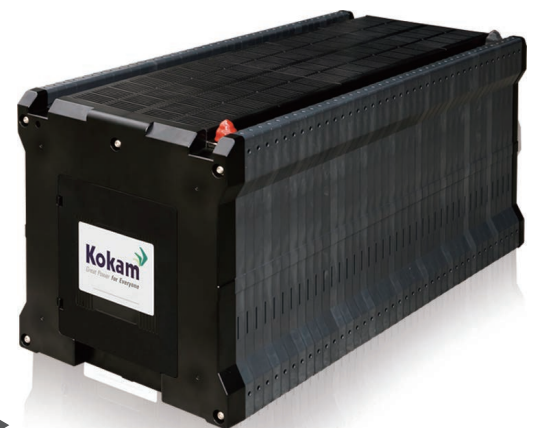
KBM 255 2P 20S - 11.1kWh ▶

Cells within the modules are maintained at optimal temperatures to enable a longer life cycle. Optional heat sink plate can be provided to cool electronic components and increase thermal capability.